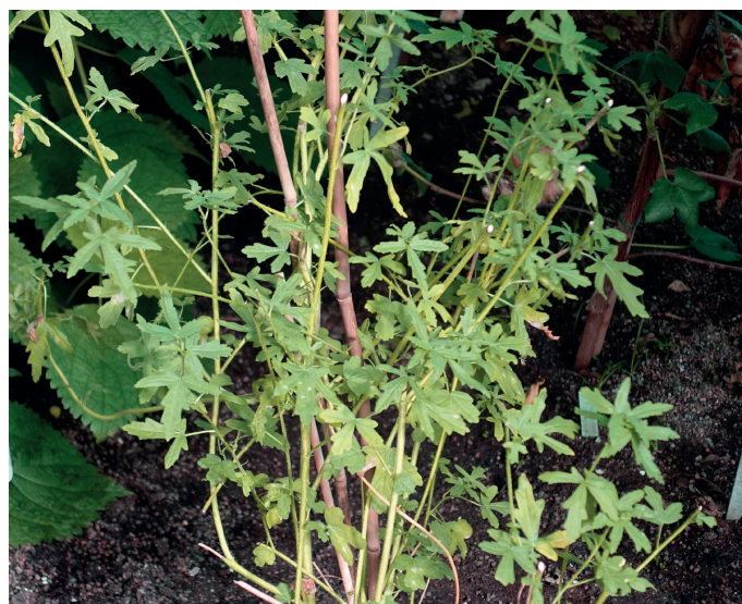
Kenaf ( Hibiscus cannabinus L.)

The ecological impact of post-harvest processing of kenaf fibres into various finished products is difficult to assess because manufacturers don't disclose them referring to their proprietary rights.